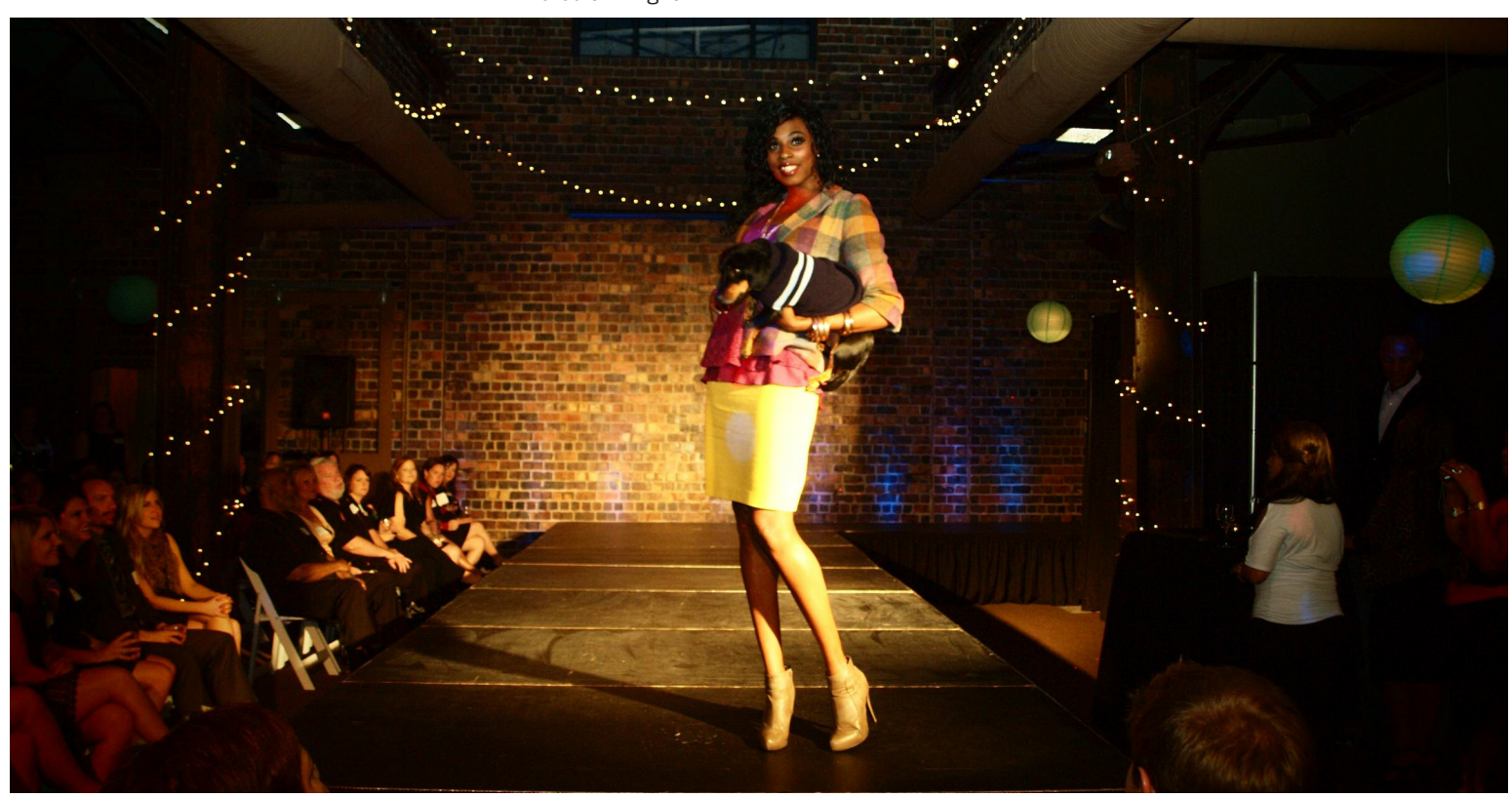
Guests enjoyed a fashion show presented by Elisashley and CAbi.