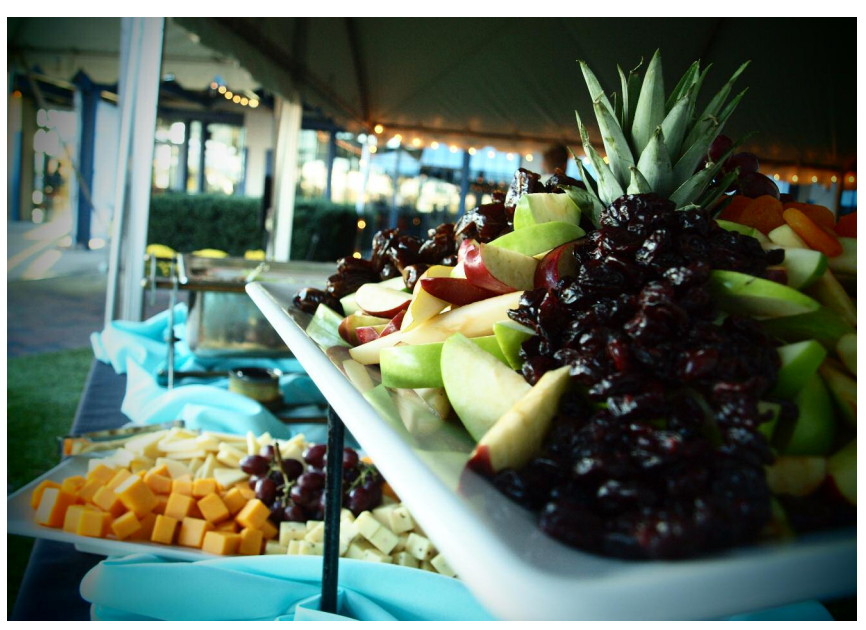
Guest enjoyed delicious food.