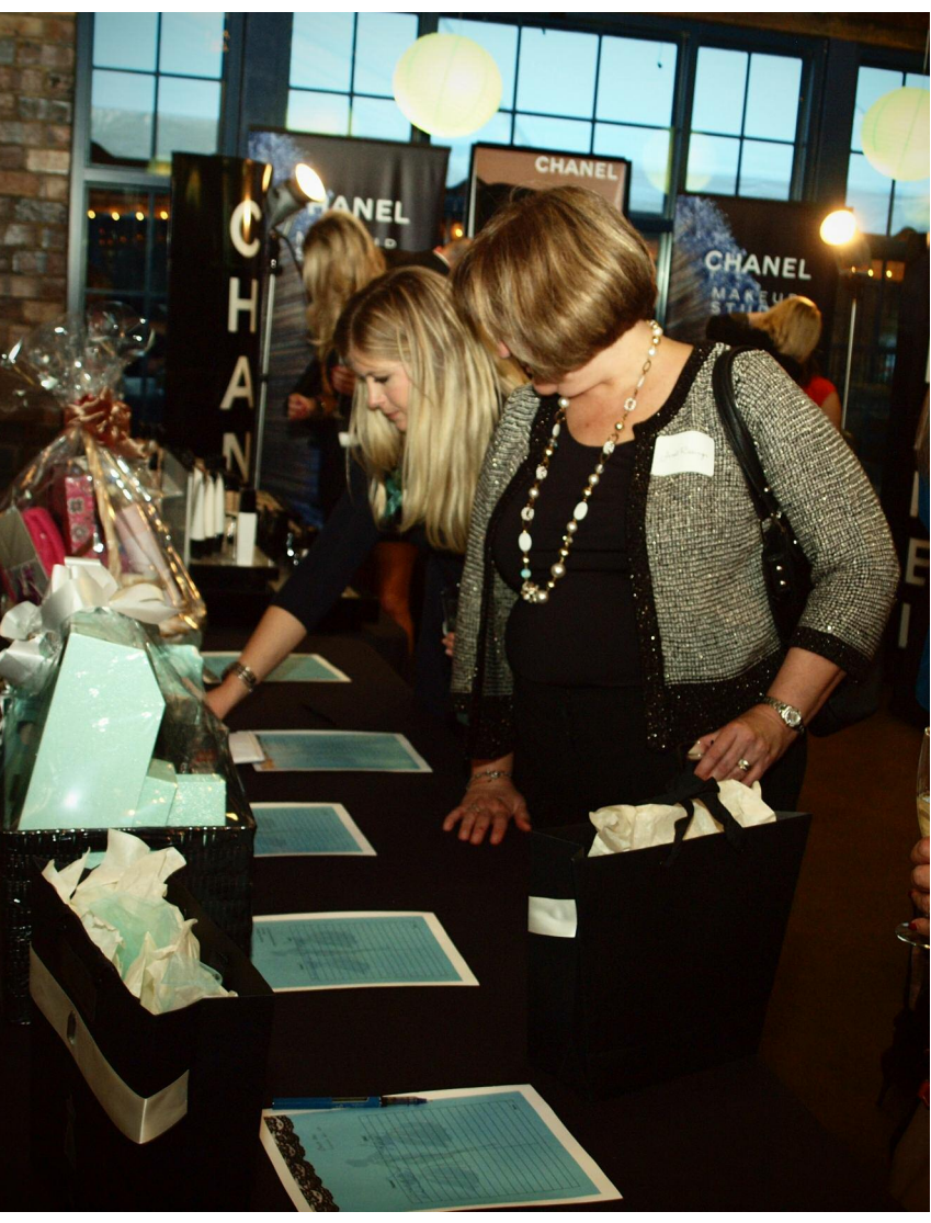
Guests were able to participate in a silent auction that benefited the Ohio Women's Bar Foundation.